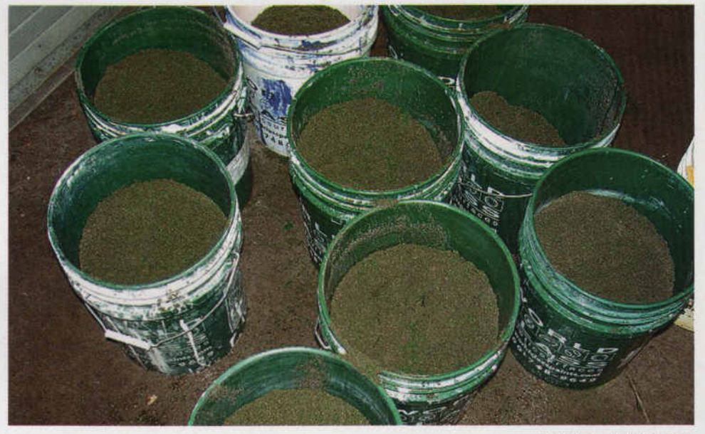
Dyed divot mix in final form.

Not all the seed survives but those that do represent mature plants for next year's field. Seeds that are visible after placing the divot mix and seeds that are placed too deep will seldom establish, however those just below the surface will develop if watered. The seeding rates seem very high compared to the normal broadcast seeding rates for grass establishment on bare ground. With divot mix it is important to remember