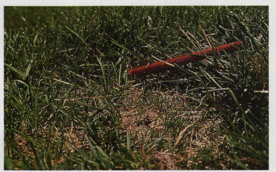
Divot mix seedlings at 4 days.