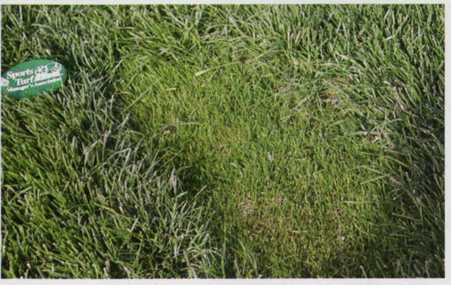
One-week old divot fuzz.