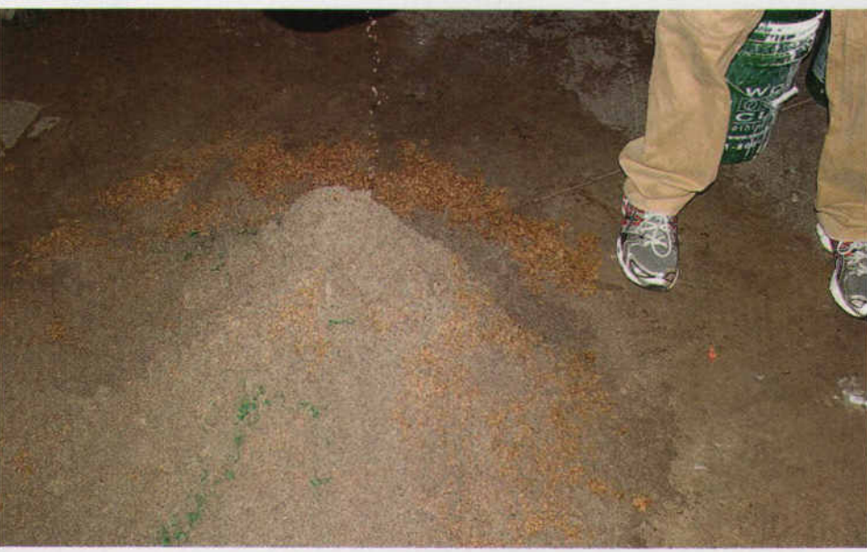
Divot dye mix at the beginning.

er and allow a few minutes for drainage. A concrete or smooth blacktop surface works fine for mixing. Dump a 5-gallon bucket of sand on the surface and add some seed, calcined clay, and dye over the pile. Mix on a sheet of plastic or a tarp to avoid staining of the hard surface if desired. Continue adding sand, seed, calcined clay, and dye