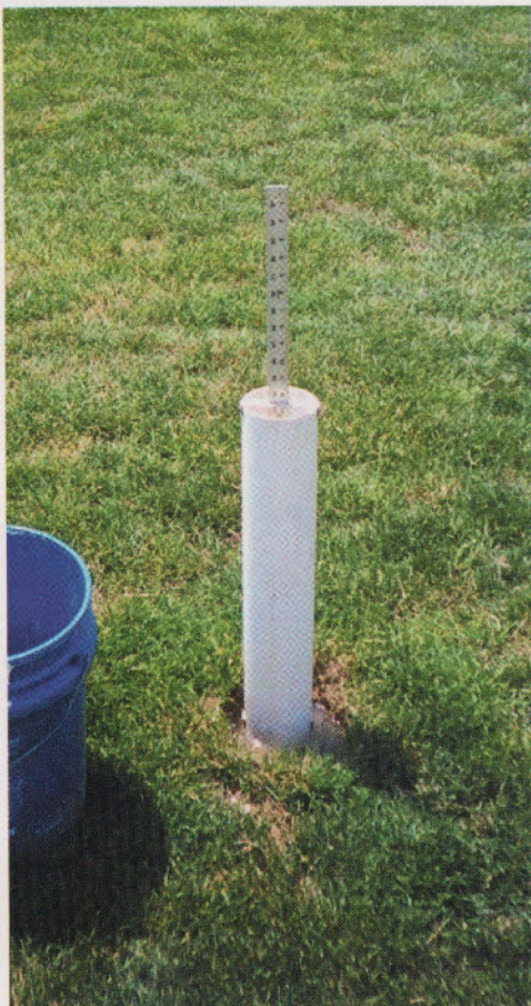
This device measures the rate of water percolating through the soil profile.