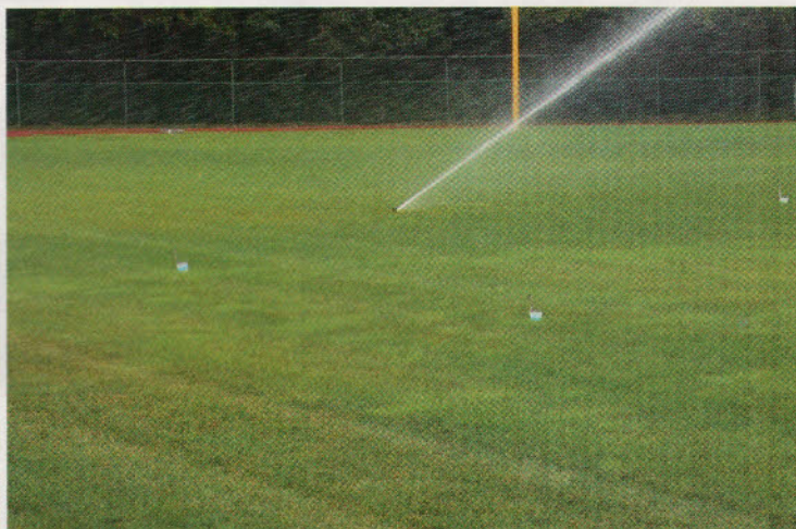
The catch-can devices that you use for capturing precipitation should be uniform and level.

It identifies your site-specific turfgrass water requirements and allows you to customize your program. Your field has specific water requirements that are dictated by the turf species growing in your field. For example, if all growing conditions were equal, perennial ryegrass would still require more water than tall fescue and bermudagrass. Consider the severity of use that your turf is subjected to, the depth of the rootzone as well as environmental stresses such as weather and shade. The level of management that your field receives and the quality expectations of the owners and stakeholders will also factor into your irrigation requirements.