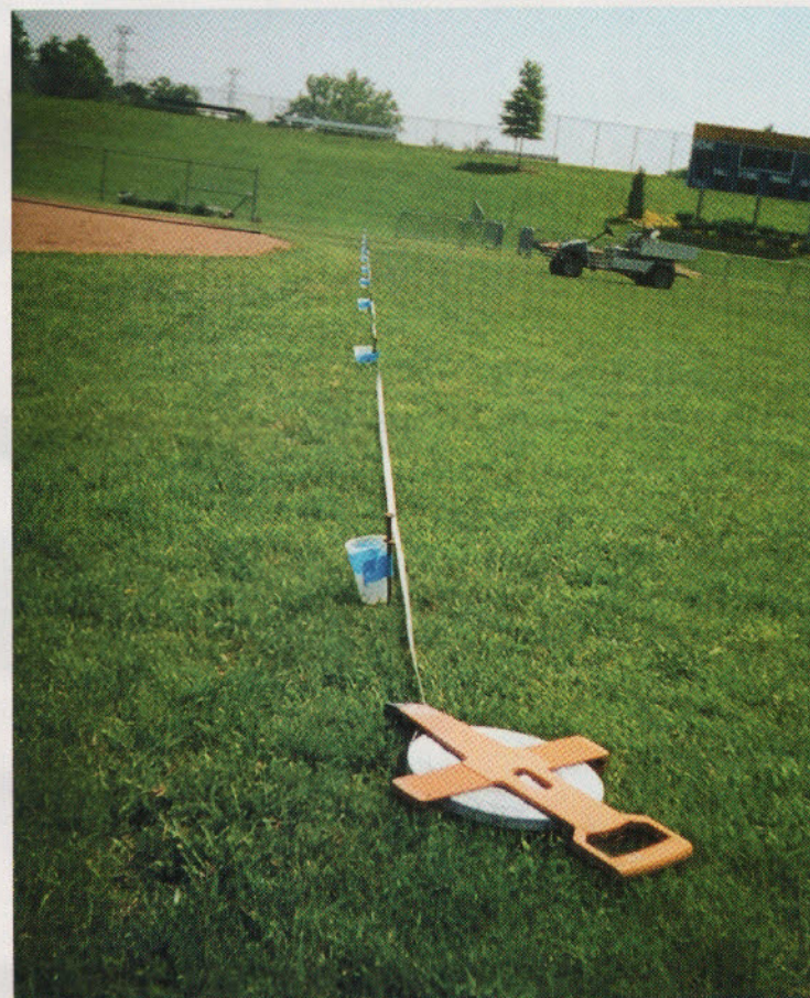
Maintain an equal distance between catch-cans for precise measurements.

Fill in 134 on reader service form or visit http://oners.hotims.com/13973-134