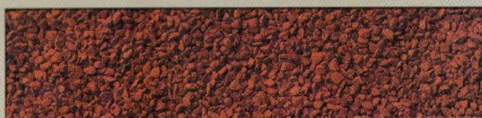
PROred PREMIUM RED TOPDRESSING

Turf managers have documented water savings of 30% and more by using AXIS in their golf courses, sports fields, and landscaping. The benefits of AXIS are permanent. It will not break down with freeze-thaw cycles and it will never plug up or stop working. You only have to apply it once for a lifetime of healthy turf.