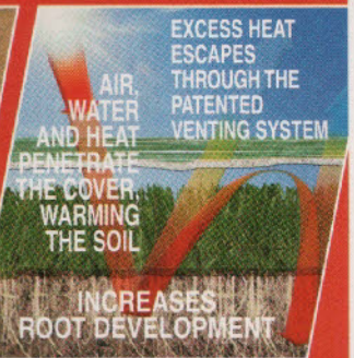
It works on the greenhouse principle, every time!