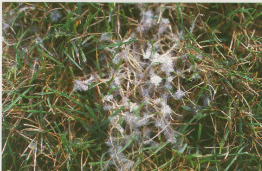
Dollar spot in perennial ryegrass. Under ideal conditions, the dollar spot fungus can produce large amounts of white or whitish-gray foliar mycelium.

Raising mowing height is effective to minimize dollar spot injury. Mowing early in the morning will speed surface drying, and has been linked to a significant reduction in the disease. Removing morning dew and leaf-surface exudates by dragging fields with a hose also can be beneficial. Using wetting agents,