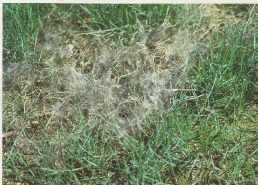
Pythium foliar mycelium in seedling turf. Pythium blight and brown patch are destructive to both seedlings and mature turf.

An autumn fertilization program using a complete N-P-K fertilizer improves turf vigor and density. Cultural