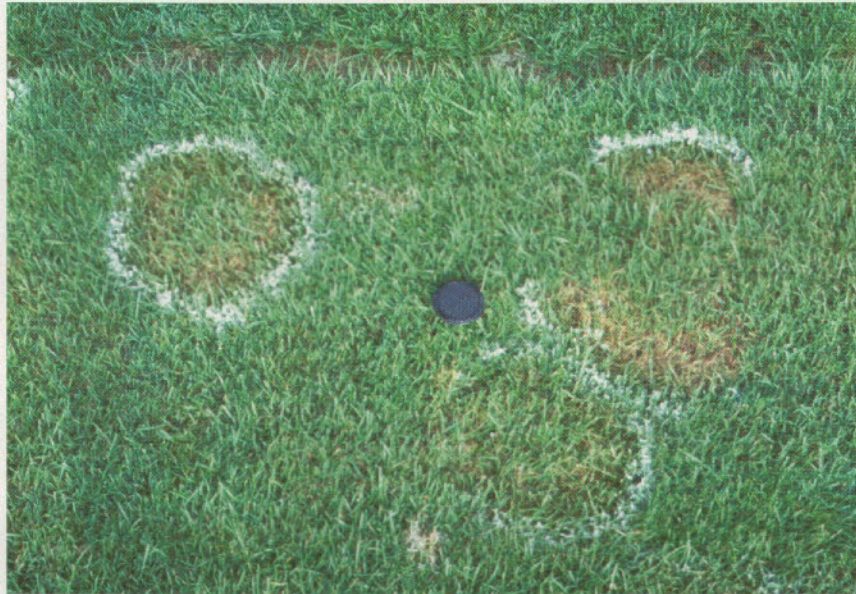
Brown patch in perennial ryegrass. The edges of the circular patches are covered by a whitish-gray foliar mycelium.

Close inspection of leaf blades reveals that the fungus primarily causes a blight or dieback from the tip, which gives diseased turf its brown color. R. solani produces distinctive and often greatly elongated lesions on tall fescue leaves. The lesions are a light, choco-