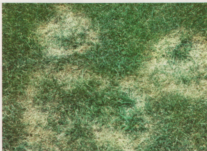
Summer patch in close cut Kentucky bluegrass. Patches may appear as tan colored dead spots 3 to 6 inches in diameter and as large circular patches.

Low mowing and frequent irrigation are the major cultural practices that exacerbate summer patch. Increase mowing height to 3 inches in late spring,