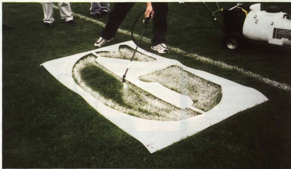
Only recently have organic pigments become popular; earlier problems included their relatively high cost compared with leaded pigments.

Only recently have organic pigments become popular; earlier problems included their relatively high cost compared with leaded pigments. Today, organic pigments can now be synthetically manufactured, offering you stronger tint strengths, better light fastness (ability to keep its color), and in a