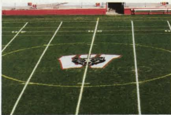
No longer can field-marking paints be considered a paint companies' scrap or reworked material.