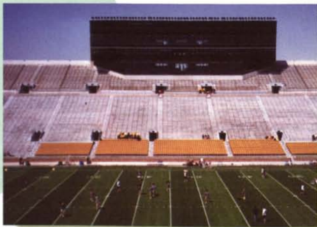
Ready for game time! The Notre Dame Stadium field awaits the fans.

An understanding of the physiological aspects of grass is essential in turf maintenance. During my 17 years at Notre Dame, one of the biggest agronomic challenges was the diversity of fields I managed.