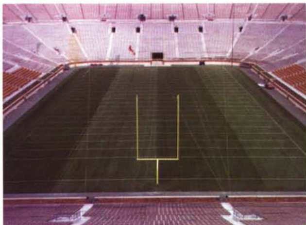
The fans never see the varied mowing techniques necessary to keep the turf healthy.

Food is manufactured by a complex series of processes known as photosynthesis. Energy provided by sunlight causes carbon dioxide and water to combine and form the food source for the plant. The food is used by the plant to produce energy and build cells and tissue. Energy is required for plant growth and development. The release of energy is the result of a process known as respiration. In turf management, respiration results in growth. A balance between fuel production (photosynthesis) and fuel consumption (growth via respiration) must be maintained and is critical when developing mowing and other management strategies (see table 1).