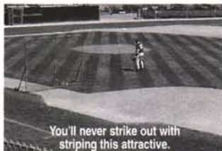
You'll never strike out with striping this attractive.