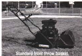
Standard front throw basket.