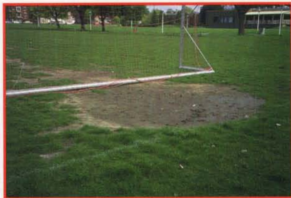
Depressed surface grading, destroyed soil structure and compaction: a classic example of integrated drainage problems.

Of course, fine particles can migrate through the system and clog up the pipes. These should be flushed out periodically to maintain flow velocity. The