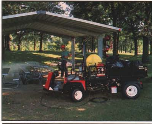
One machine with multiple uses spreads costs and increases productivity.

help raise part or all of the funds? Will local merchants or service clubs help cover costs?