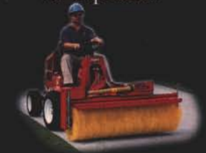
It's a sweeper.