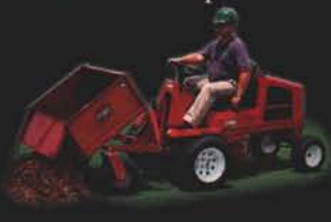
It's a dump cart.