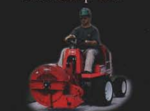
It's a blower.