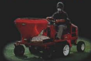
It's a spreader.