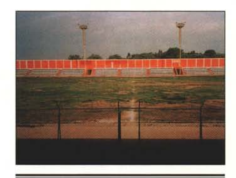
Figure 2: Prior to renovation with Sahara bermudagrass, Carlos Benavides' turf consisted of a hodgepodge of various cool- and warm-season grasses on a very rough surface.

hand-held spreaders at a rate of 2 lbs. per 1000 sq.ft. They raked the soil in two directions to ensure seed-to-soil contact.