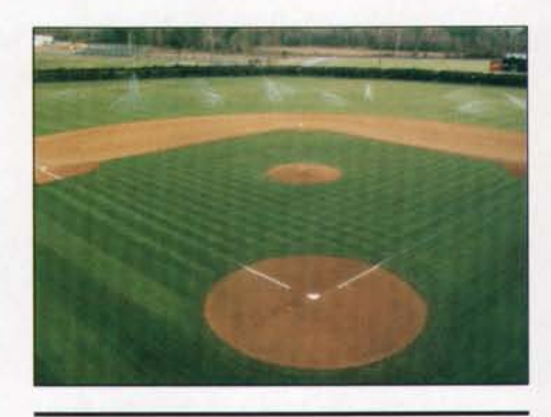
A state-of-the-art sprinkler system helps maintain Fike's field, which is enhanced aesthetically by crosshatching of the infield.

Flowers overseeds with Topflite perennial ryegrass following the last home game in mid-October. He uses 150 pounds of seed on the infield and 700 pounds on the outfield and sideline areas. Prior to overseeding, they mark all sprinkler