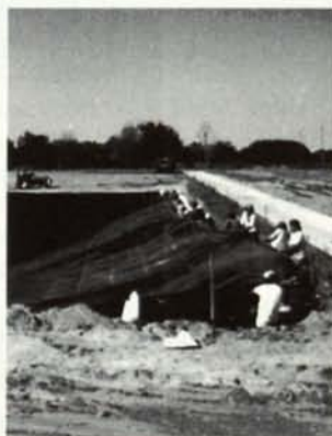
STORMWATER RETENTION POND