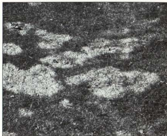
Gray snow mold.

Gray snow mold/Typhula blight is caused by the fungus Typhula incarnata , which is physiologically adapted to grow and infect at freezing temperatures. Snow cover is usually required for significant disease development. Symptoms of gray snow mold are most distinctive if seen while the disease is active, which would be at or just after snow melt. Symptoms include white to grayish brown, roughly circular patches of four to eight inches in diameter. Larger irregular shapes may occur when patches coalesce or environmental conditions favor prolonged fungal activity. White to gray fungal mycelium may be seen matted on diseased foliage. Also, close inspection may reveal fungal structures called sclerotia imbedded in decaying leaves. Sclerotia are roughly spherical,