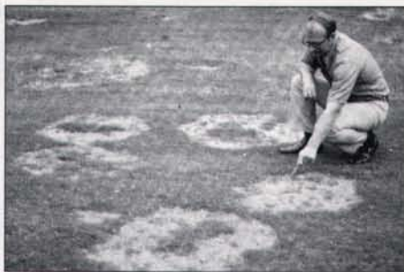
Spring dead spot.

Blades are bleached and the outer edge can be covered with a grayish-brown mycelium, while light tan sclerotia may be found near the crowns of the plants. Grass within the rings does retain its color. Often, on small turf areas, many rings are present, forming a mottled pattern.