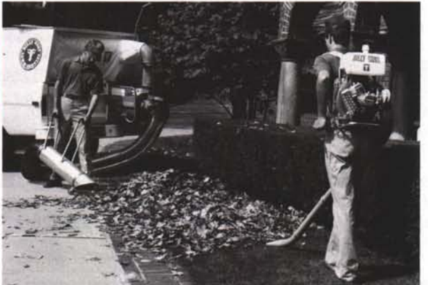
Use the backpack blower to remove debris from shrubs and hard-to-reach areas.