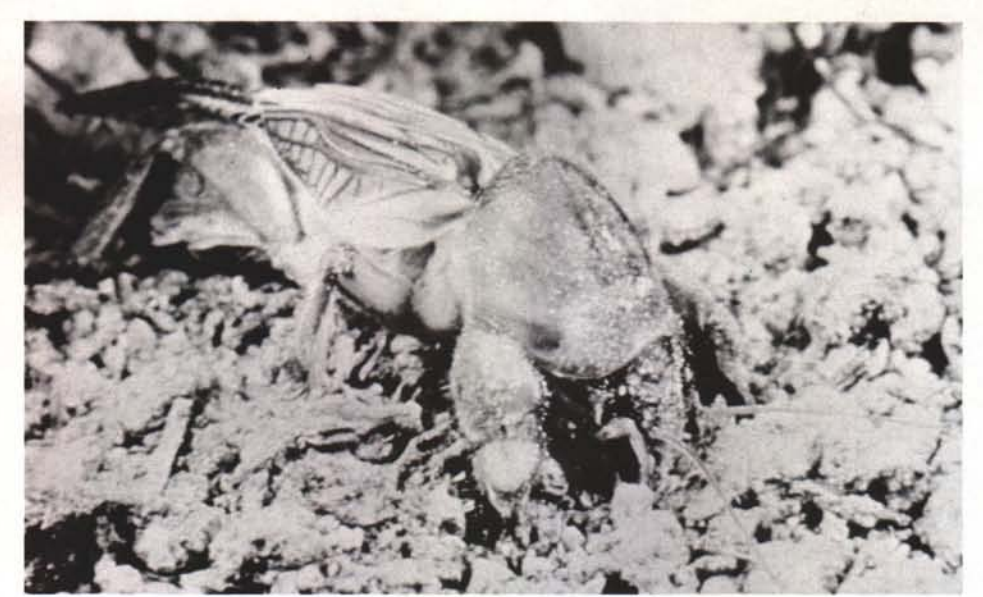
Southern mole cricket nymph.