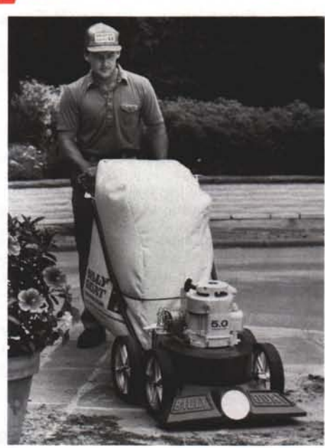
The suction sweeper is used for sweeping up leaves in outlying areas, away from the truck.