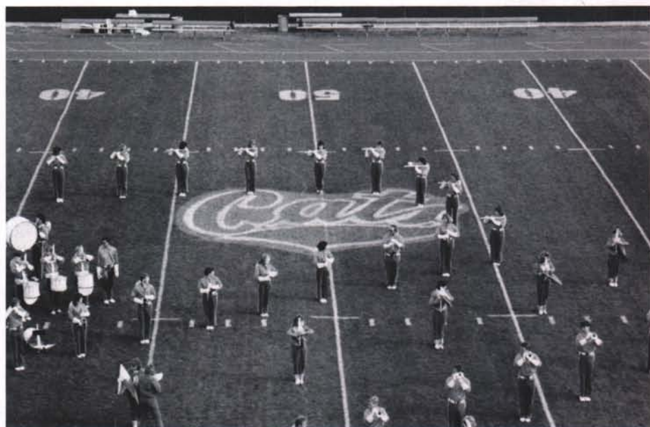
Montana State University painted a blue, yellow and white logo on the center of its stadium field for its fighting bobcats.

in the Southwest. The Los Angeles Coliseum was selected in 1967 as the location of the first Super Bowl. The National Football Conference had just merged with the American Football Conference. The National Football League wanted to present a championship between the winners of both conferences and create a media event. The common bermudagrass in the Coliseum was dormant. NFL Commissioner Pete Rozelle wanted an impressive green field for the contest to be televised nationally. If the studios could paint the turf on their sets during the winter, the NFL saw no reason why it could not do the same for its important premiere at the Coliseum.