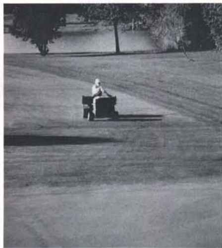
Colorant added to spray tank lets applicator cut down on overlaps and skips on fairway.