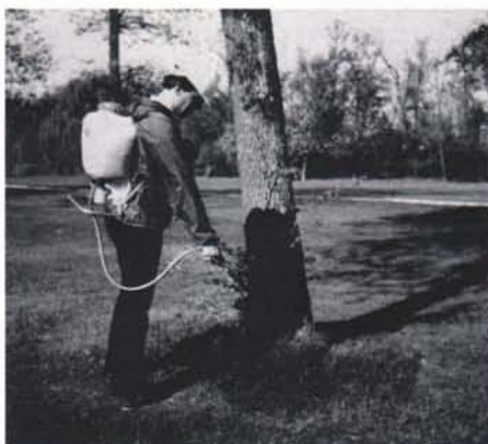
Spray indicators enable applicators to see where they have sprayed herbicides and if they have achieved good coverage.

Blue colorants are the easiest to see and