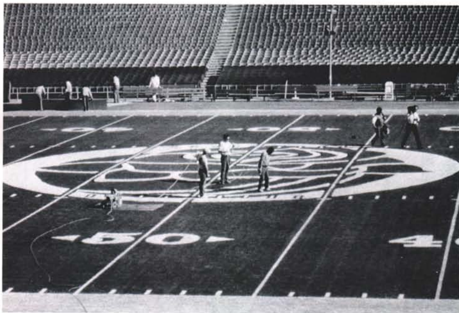
A single red and white rose graces the center of the Rose Bowl each year.

S ports represent one of the largest industries in the American economy. Billions of dollars are spent each year for tickets, greens fees, television rights, corporate sponsorships and even legalized gambling. The stakes have become too high to leave such a valuable part of the American economy up to nature alone.