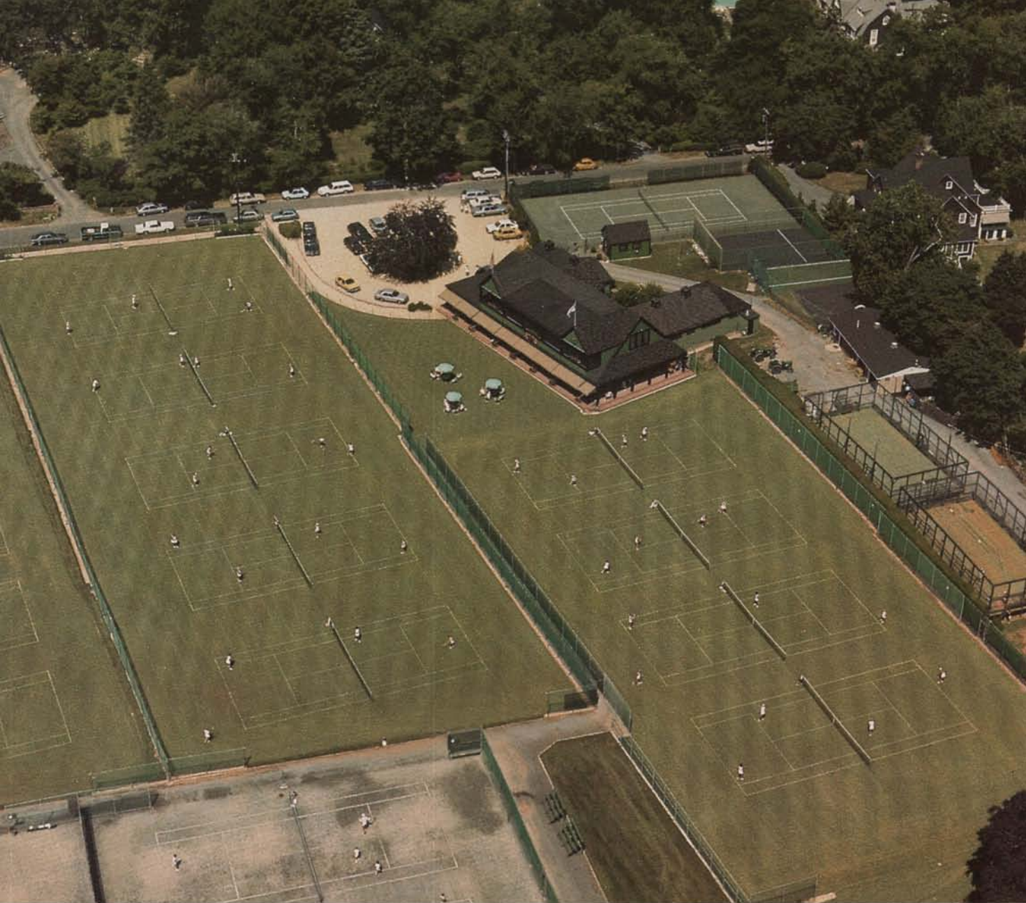
Seabright Lawn Tennis Club offers its membership a variety of tennis court surfaces, including all-weather, clay and bentgrass.