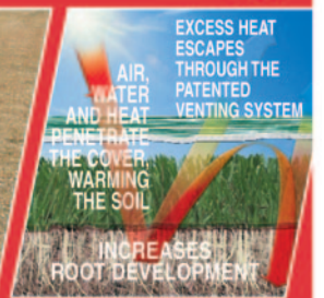
It works on the greenhouse principle, every time!