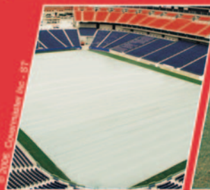
Covers for football and soccer fields are also readily available.