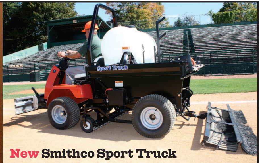
New Smithco Sport Truck

The Smithco Sport Truck does it all, conditioning your field with the right amount of smoothness and consistency for safety and playability.