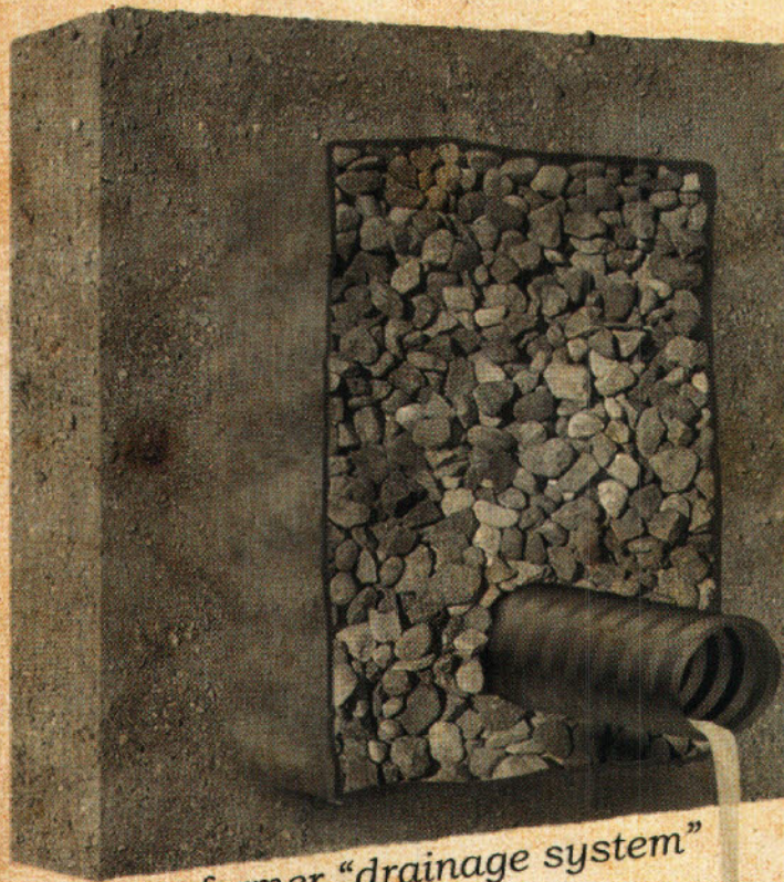
former "drainage system"

EXTRA! EXTRA! EXTRA! EXTRA! EXTRA! EXTRA! EXTRA!