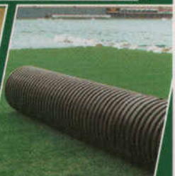
Covers for football and soccer fields are also readily available.