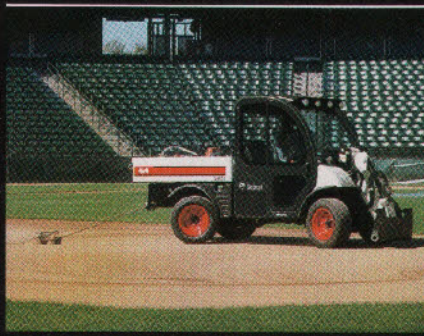
Toolcat™ 5600 grooming infield

When you have to score big, send in your Most Valuable Players — Bobcat compact equipment! Whether the game is sweeping, mowing, grading, leveling, pulling, pushing, lifting, loading, unloading or carrying — just put these major league machines on your team and have a winning season all year long.