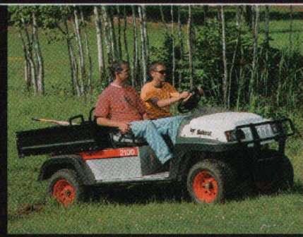
2100 utility vehicle carries cargo and two passengers