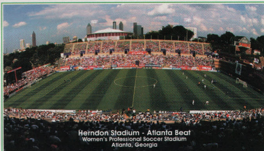
Herndon Stadium - Atlanta Beat Women's Professional Soccer Stadium Atlanta, Georgia

Circle 119 on card or www.oners.ims.ca/2907-119