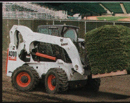
All-wheel steer loader moving sod