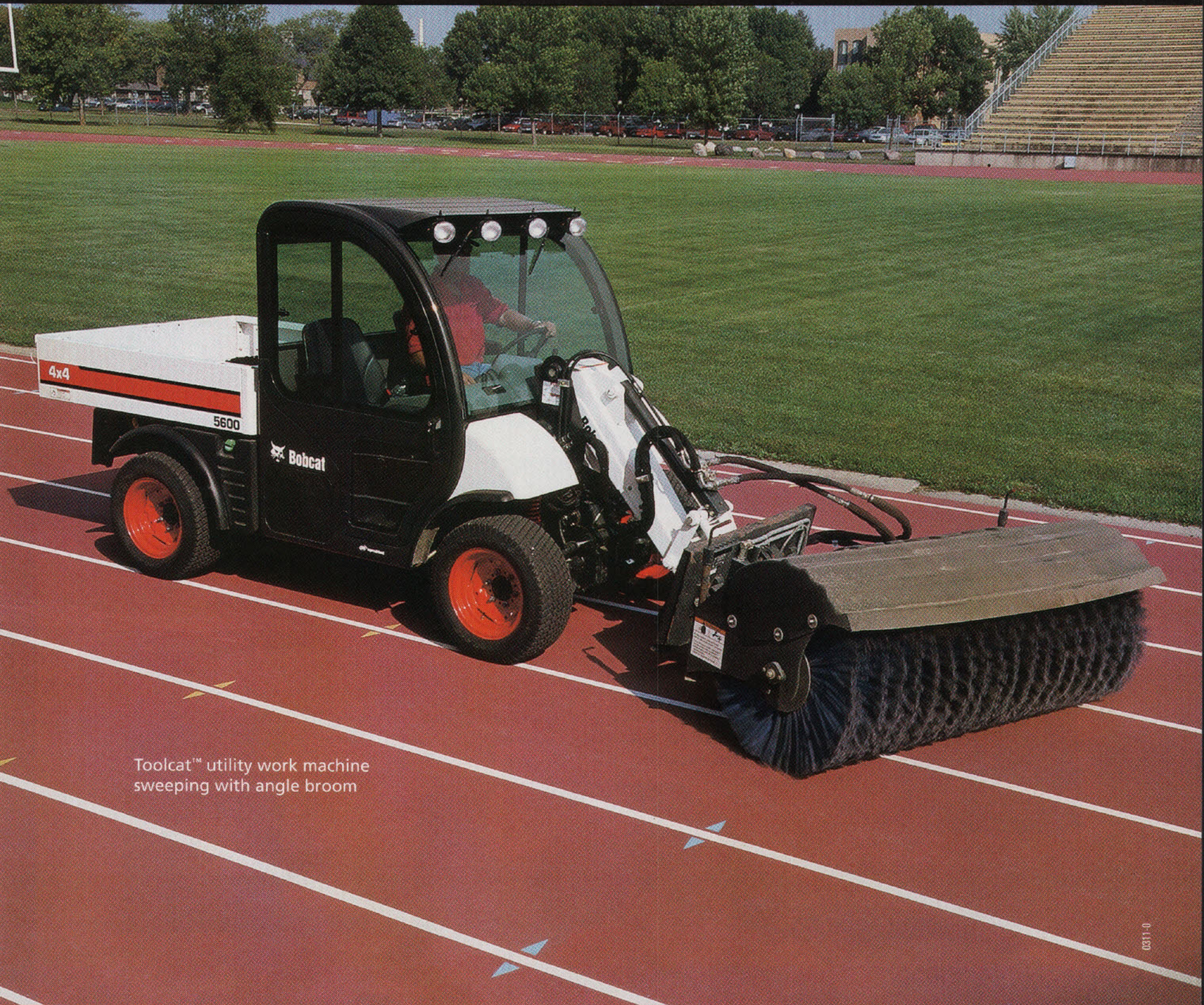
Toolcat™ utility work machine sweeping with angle broom