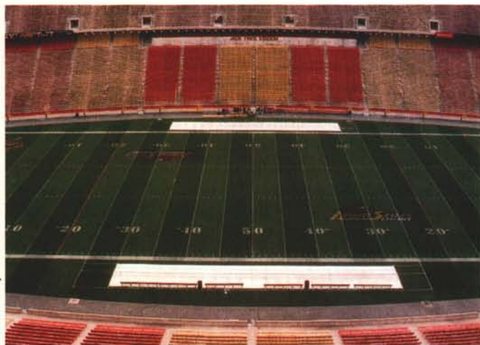
Closely monitoring turf, and using proactive rather than reactive strategies, helps develop strong, healthy and attractive playing surfaces.