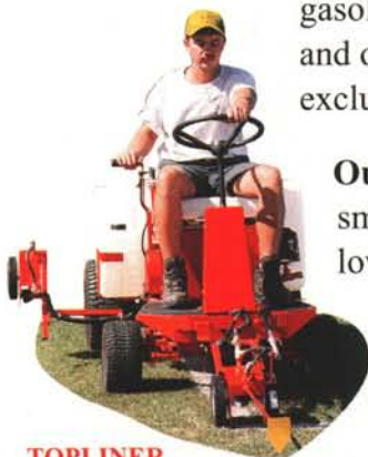
TOPLINER Field Marker

Our Topliner Field Marker. Here is the field liner with smooth-performance hydrostatic drive, precise control and low maintenance. It features both front and side mounted spray boxes, for painting all types of lines and designs. A double-tip nozzle system paints from opposite directions to give you especially heavy, durable markings. Only from Smithco.