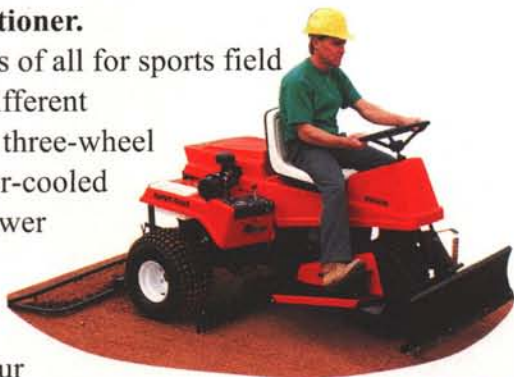
SUPER RAKE AFC Field Conditioner

Our Super Rake AFC Field Conditioner. One of the most popular conditioners of all for sports field maintenance. It is available in four different models, offering either two-wheel or three-wheel drive and air-cooled gasoline or water-cooled diesel engines - all with hydraulic power for smooth, reliable performance. Only from Smithco.