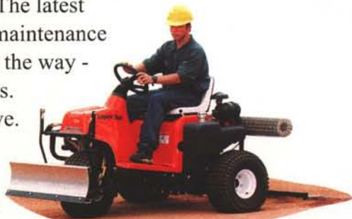
SUPER STAR AFC Field conditioner

Our Super Star AFC Field Conditioner. The latest addition to our family of great sports field maintenance equipment. It is hydraulically controlled all the way - power system, braking, all of its implements. Choose from two-wheel or three-wheel drive. Its high performance, quiet, air-cooled gasoline engine requires little maintenance and our "step-through" chassis design is an exclusive feature. Only from Smithco.