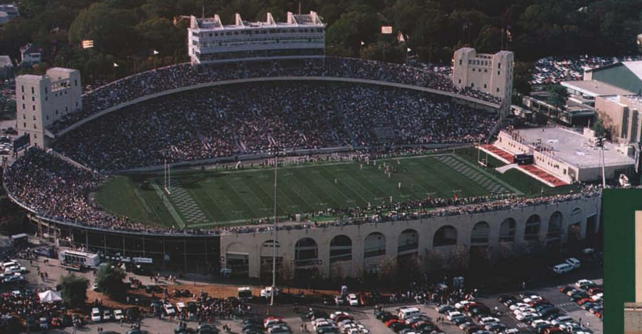
Ryans Field, Northwestern University, Evanston, IL