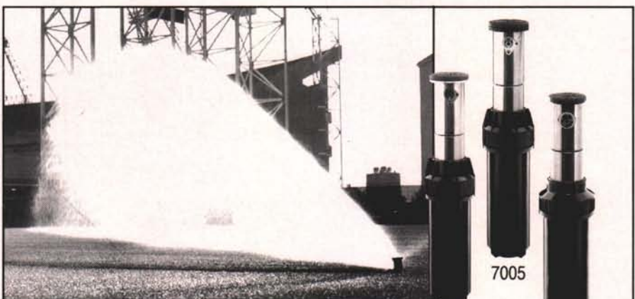
ALLTEL Stadium - Home of the Jacksonville Jaguars