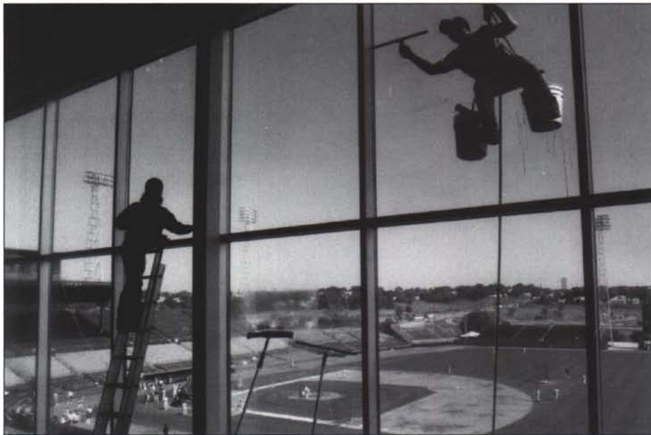
Rosenblatt field.

and the pitcher's mound rubber and sort of waved goodbye. The heavy equipment took over and started tearing things up that night. By noon on September 5, it looked an A-bomb had hit."