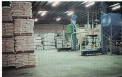
Seed is warehoused, blended and shipped from a 30,000-square-foot LESCO facility in Silverton, Oregon.

LESCO, Inc., 20005 Lake Road, Rocky River, Ohio 44116 (216) 333-9250