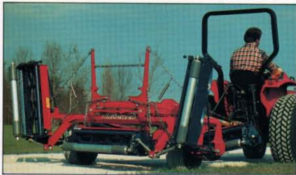
Hydraulic or manual lift for easy transport or storage.

The standard mower is ideal for the roughs on golf courses, with its easy "quick height of cut" adjusters, and also for parks, recreation fields, school boards, municipalities and turf growers.