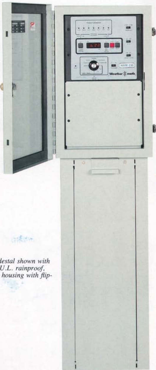
◀ MRMP pedestal shown with lockable, U.L. rainproof, heavy-gauge steel housing.

For the up-close and personal story on our family of Mark Series controllers, call or write today. Better yet, ask for a demonstration. (214) 278-6131 FAX (214) 271-5710