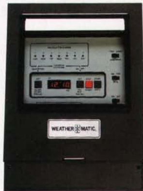
E-Series plastic housing features viewing window, slide-up cover. For indoor use. ▶