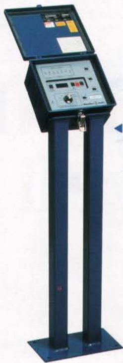
◀ SRMP pedestal shown with lockable, U.L. rainproof, aluminum housing with flip-up lid.