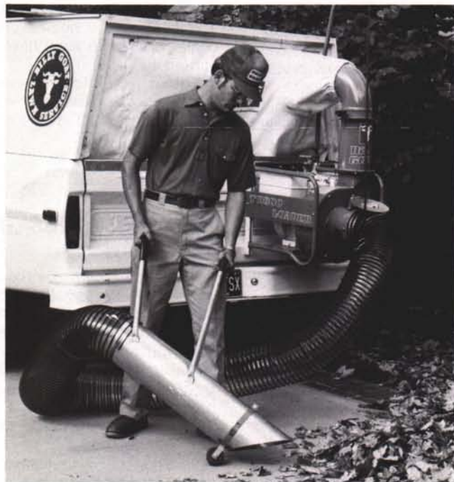
The intake hose vacuums leaves piled up around the truck and sends them through the four-bladed steel impeller in the truck loader. By crushing leaves and debris into small particles, the impeller greatly reduces bulk. This allows the truck to hold more debris and prevents operators from having to unload the truck as often.