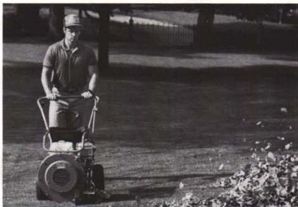
Use the heavy duty wheeled blower to move large quantities of leaves toward the truck.