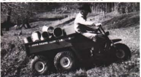
The AMT 600 from John Deere carries