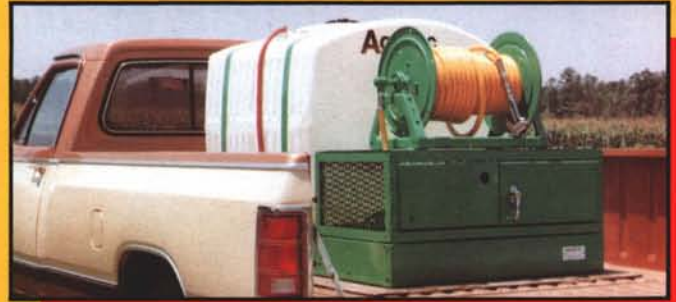
200 gallon skid #ASH2440 (shown with Security Cabinet #EF4302 & Reel kit #EK0386)