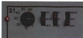
Individual station switches allow the choice of 3 programs, minute or hour timing, and station repeat capability.

Three independent programs for multi-purpose watering schedules give you the option of using the turf, shrub and drip functions alone or in dual combinations of turf and drip or shrub and drip.