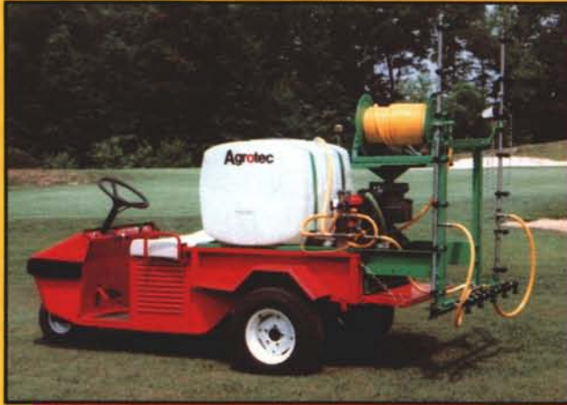
100 gallon skid #ASD 1054 (shown with reel kit #EK0385 & 15' boom #EB3158)