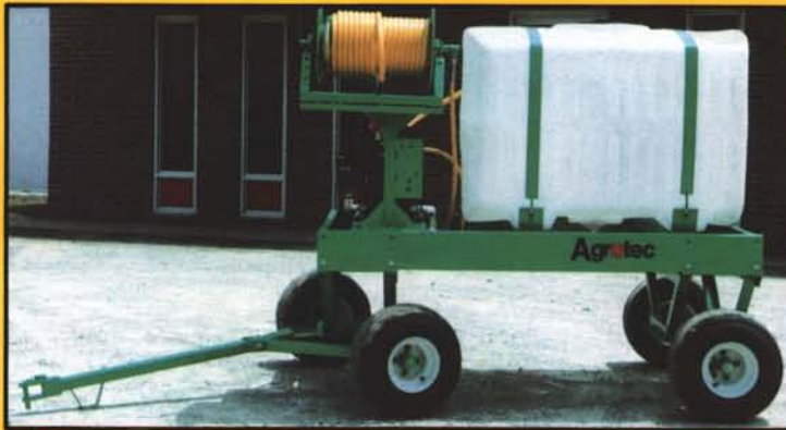
200 gallon skid #ASH2454—4 wheel wagon kit #EF4371 (shown with Reel kit #EK0385)