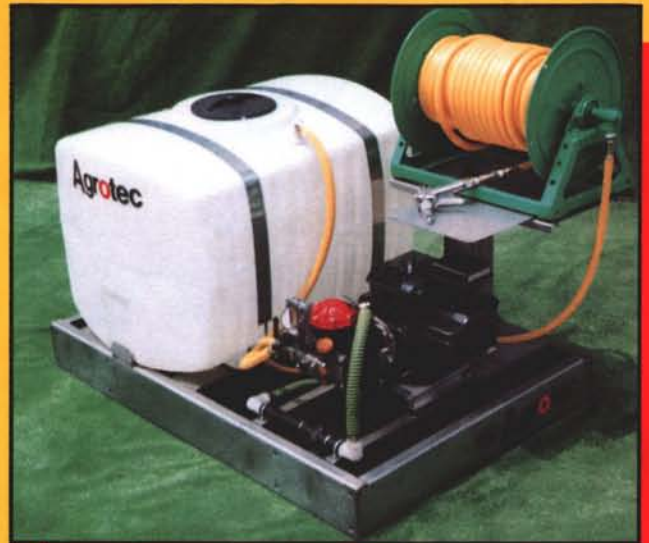
100 gallon skid #ASE1054SS—All stainless steel frame (shown with reel kit #EK0385SS)

Fits pick-ups, turf utility vehicles, or converts to trailer with wheel kit #EF4359—Booms available in 15' and 21'