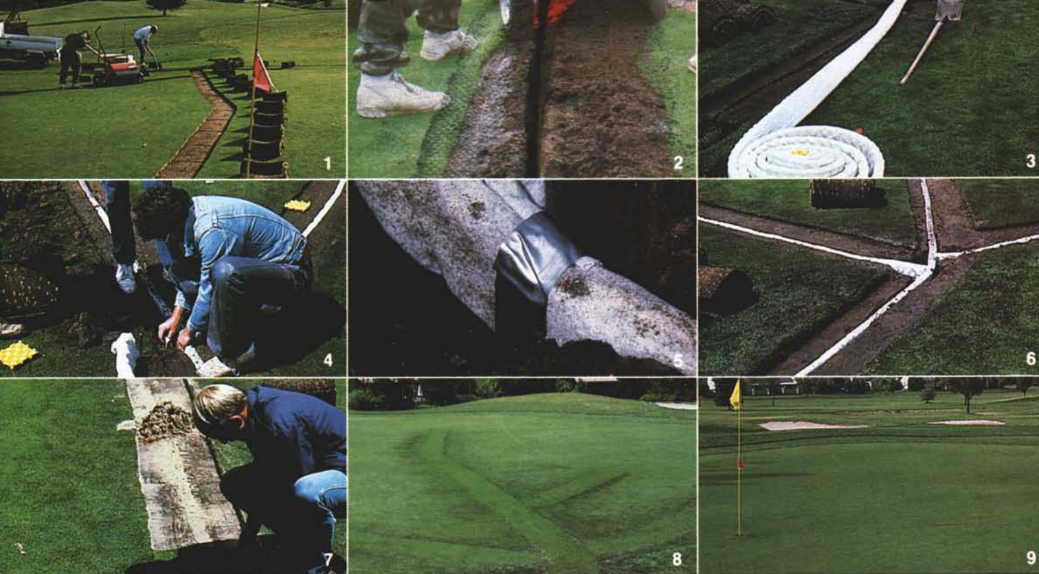
1. Rolling back sod where TerraFlow lines will run. 2. Cutting 2" wide trench. 3. Laying TerraFlow lines in 12" deep trench. 4, 5. Joining TerraFlow lines using only a utility knife and duct tape. 6. Fully installed TerraFlow System. Workers backfill with site soil, puddle with sand. 7. Replacing sod. 8. Completed TerraFlow System. Installation time: about 100 ft. per hour. 9. Green was back in play in 2 hours with TerraFlow.

Warren's® Turf Professionals just cut the cost of your next drainage system by 60%.