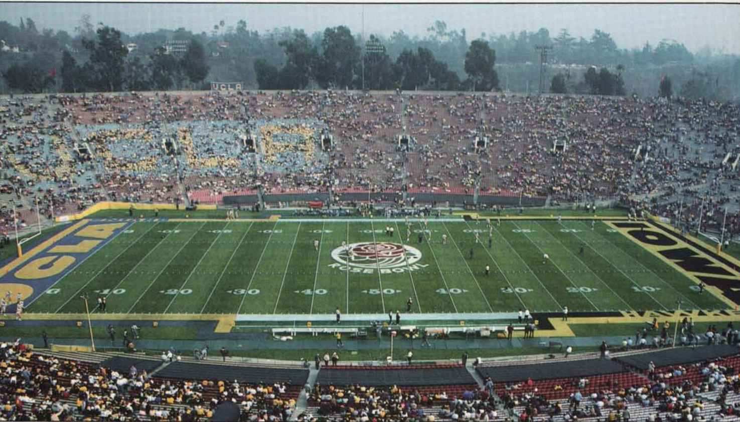
The Rose Bowl at Pasadena, CA, January 1, 1986

New generation perennial ryegrasses provide 'near perfect' playing surface . . . prove older ryegrass varieties to be passé