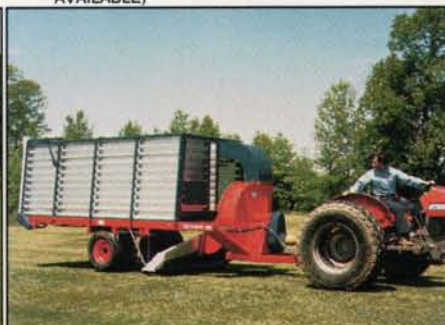
THE LARGE CAPACITY BROUWER-VAC 155