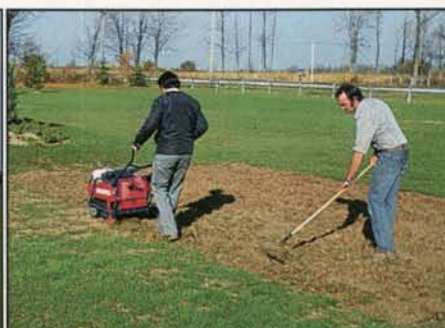
BROUWER SOD CUTTER/RENOVATOR 157