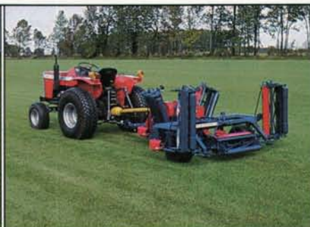
5-GANG HYD. LIFT MOWER IN TRANSPORT 151