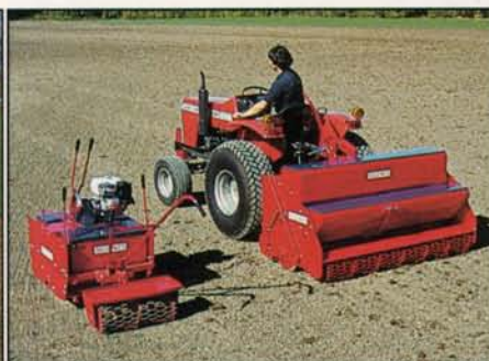
MODELS 24 & 67 LAWNMAKER-SEEDER 158