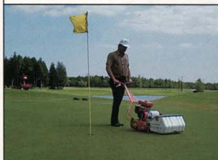
THE BROUWER GREENSMOWER 156