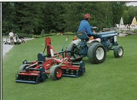
SUPER-3 P.T.O. MODEL (ENGINE MODEL AVAILABLE) 152