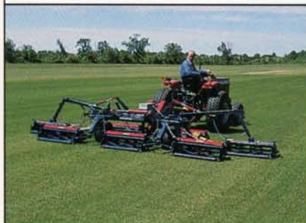
7-GANG/FAIRWAY HYD. LIFT MOWER 150