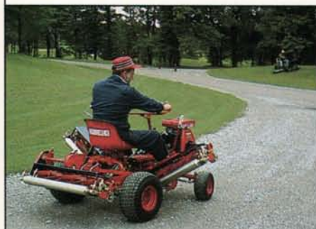
BROUWER TRIPLEX-376 153