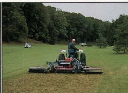
5-GANG VERTI-CUT VERTICAL MOWER 154