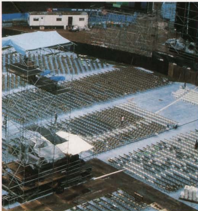
TerraCover™ . . . for entire Sports Fields and Stadium Turf Areas

It breathes naturally . . . assures free passage of oxygen, carbon dioxide, water and some sunlight so turf stays healthy, beautiful and green.