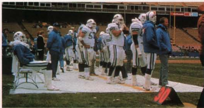
TerraCover™ Bench Tarp for Bench Areas, Infield Areas, etc.

TerraCover™ is easy to put down and take up . . . can be ready for the crowds in far less time than plywood.