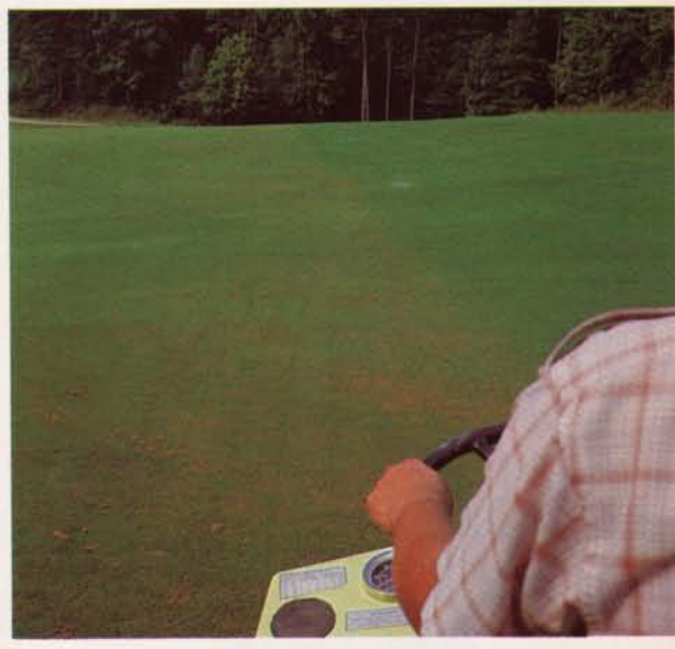
Operator can easily see exactly where he has sprayed

Dy'on colored spray solutions also show the operator if he has chemical on his skin and should wash. And the colored spray solution indicates whether a tank is clean of previous sprays.