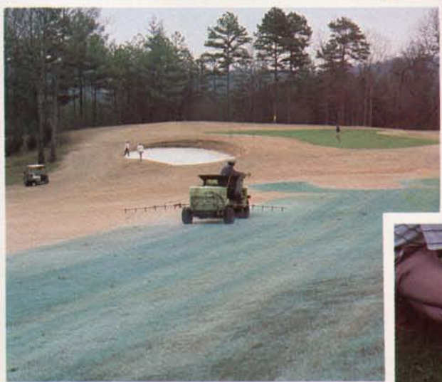
Dy'on being sprayed on dormant burmudagrass