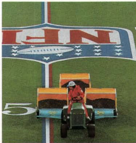
Estate Master's 8' plus swath makes quick work of Super Bowl XIX cleanup for George Toma's "Sod Squad."

what I call the 'speed factor.' The Estate Master is the only sweeper that lets you clean a swath over 8 feet with every pass."