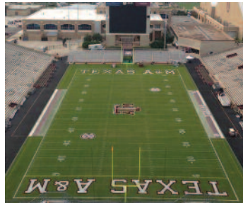
▲ Above Left: Venerable Kyle Field is being enlarged to accommodate more than 102,000 "12th men" on football Saturdays. The renovation plans include dropping the playing surface 8 feet and pushing it south 16 feet to add more seats. Above Right: Goertz & Company decided on 110 pallets at $400 each plus 1,000 blocks at $20 apiece, all the while wondering how much demand there really might be.