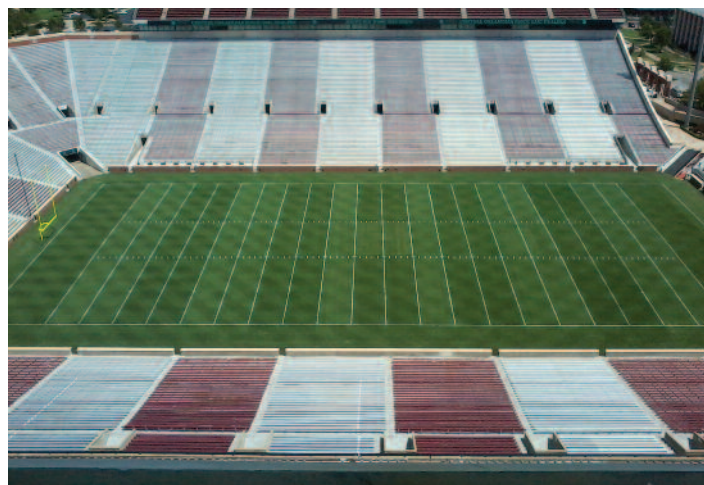
▲ PICTURE OF FIELD one month after concert ready for scrimmage.

In this particular situation and devastating event, it's more than just the grass. We do work so hard to get the grass to where we want it to optimally perform. We are passionate about our jobs and doing what is best for our fields. But grass can be replaced. It always helps to keep things in perspective. Be sure that we take time to appreciate the ones we really live for. You can't replace someone that