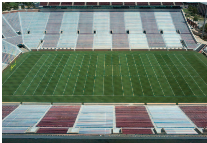
▲ PICTURE OF FIELD one month after concert ready for scrimmage.

In this particular situation and devastating event, it's more than just the grass. We do work so hard to get the grass to where we want it to optimally perform. We are passionate about our jobs and doing what is best for our fields. But grass can be replaced. It always helps to keep things in perspective. Be sure that we take time to appreciate the ones we really live for. You can't replace someone that