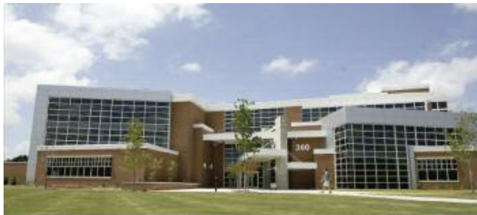
► THE NEW TEACHING FACILITY at Horry Georgetown Technical College