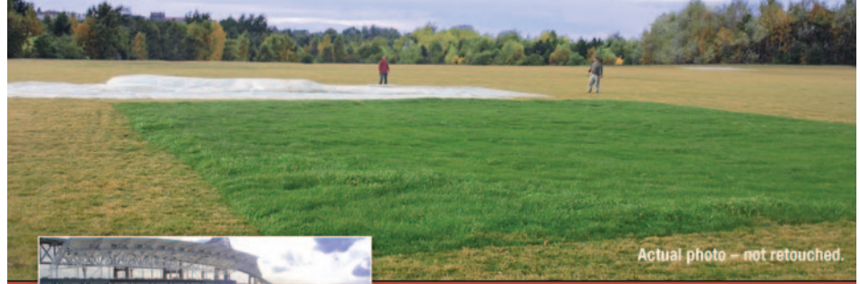
Actual photo – not retouched.