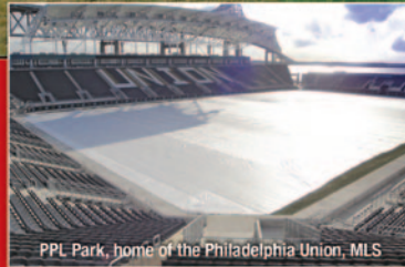
PPL Park, home of the Philadelphia Union, MLS