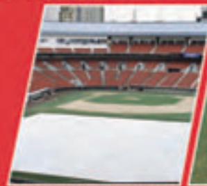
Covers for football and soccer feldts are also readily available.