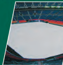
Covers for football and soccer fields are also readily available.