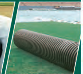
TARPMATE™ roller comes in 3 lengths with safety end caps.