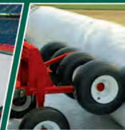
TARP MACHINE™ lets you roll the cover on and off in minutes.