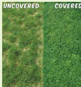
>> BEFORE/AFTER photo taken at Shaw Park, Clayton, MO on 12/2/2010.

FieldSaver winter turf blankets/growth covers feature Woven Polypro, translucent fabric with 90% light pass-through for better, quicker growth; hems and brass grommets means the cover can be secured with staples or stakes that stay put; and optional yellow safety color stakes mean more visibility, reduces tripping hazards and prevents loss of stakes in