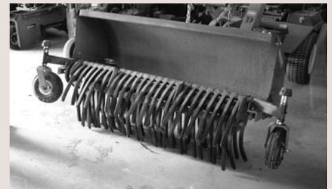
>> THE “SLAPPER” developed by Rutgers.

A new machine, recently developed by Rutgers University and nicknamed the “Slapper,” modifies a Toro Sweepster unit by replacing the wire brush with rubber “fingers,” or paddles from a potato harvester. The Slapper bruises and damages leaf tissue (simulating wear only), therefore a roller must be used along with the Slapper to provide compaction stress. Each of these units, and others that have been developed, play a different role in simulating and evaluating traffic tolerance.