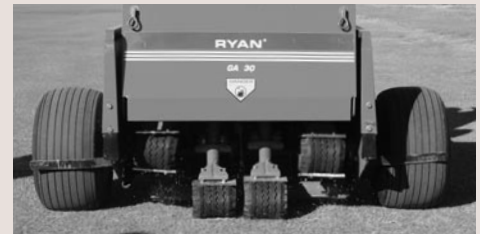
>> THE CADY , this one developed at the University of Florida and modeled after the one built at Michigan State.

To compensate for the Brinkman deficiencies, Michigan State University developed the "Cady" traffic simulator. The Cady is a modified Jacobsen Aero King 30 aerator (a self-propelled unit) that has had the steel aerating tines removed and replaced with cleat-fitted pieces of rubber tires (to simulate a cleated foot). Since the aerator consists of four shafts connected to a cam that delivers a vertical action, the Cady features more vertical downward pressure than the Brinkman. A Ryan GA-30 aerator has also been used in modifications to produce a Cady simulator.