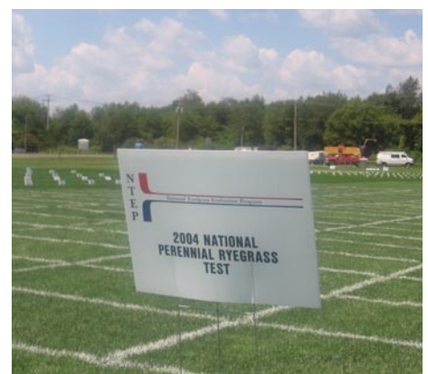
Continued on page 34

Perennial ryegrasses are a mainstay in many athletic field situations, because of positive attributes such as fast germination, better establishment under low and high temperatures and traffic tolerance. Our latest perennial ryegrass trial was planted in