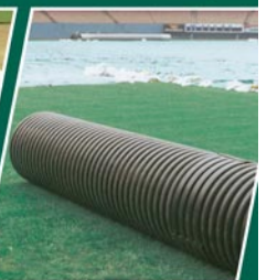
Covers for baseball fields are also readily available.