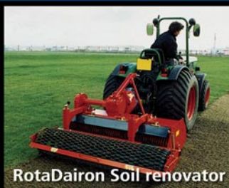
RotaDairon Soil renovator