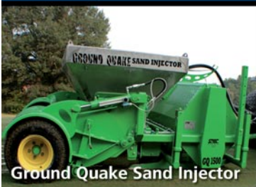
Ground Quake Sand Injector