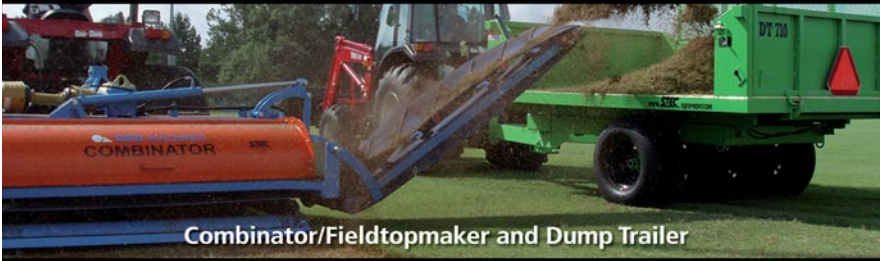
Combinator/Fieldtopmaker and Dump Trailer