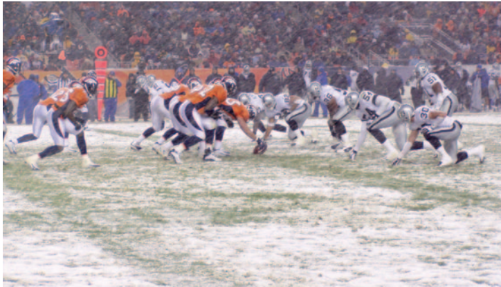
» THERE ARE NO weather-related postponements in the NFL

This job requires a lot of attention and time. The NFL is a year-round sport. A lot of preparation goes into what happens from September through January, or hopefully, February. Preparation is not only in the meeting rooms or draft rooms, but out on the practice fields or game fields. We perform cultural practices, moisture management, spray programs, and use growth regulators at certain points of the growing season to make our fields strong for 20 weeks in the fall and winter. A lot of daily attention is spent making sure our fields can withstand the abuse of 300+ pound lineman practicing