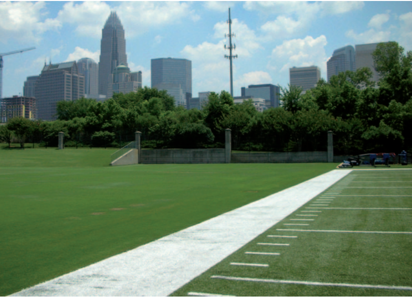
» VIEW OF DOWNTOWN Charlotte from the Panthers' practice fields

However, I don't believe anyone can go it alone. Align yourself with others in the industry and ask questions. Reach out to someone whom you respect and admire and ask them to be your mentor. Join the STMA, if you haven't already, and take advantage of all the things that the association has to offer. You will get to know those in the industry and, perhaps even more important, they will get to know you. Get a degree in sports field management because a formal