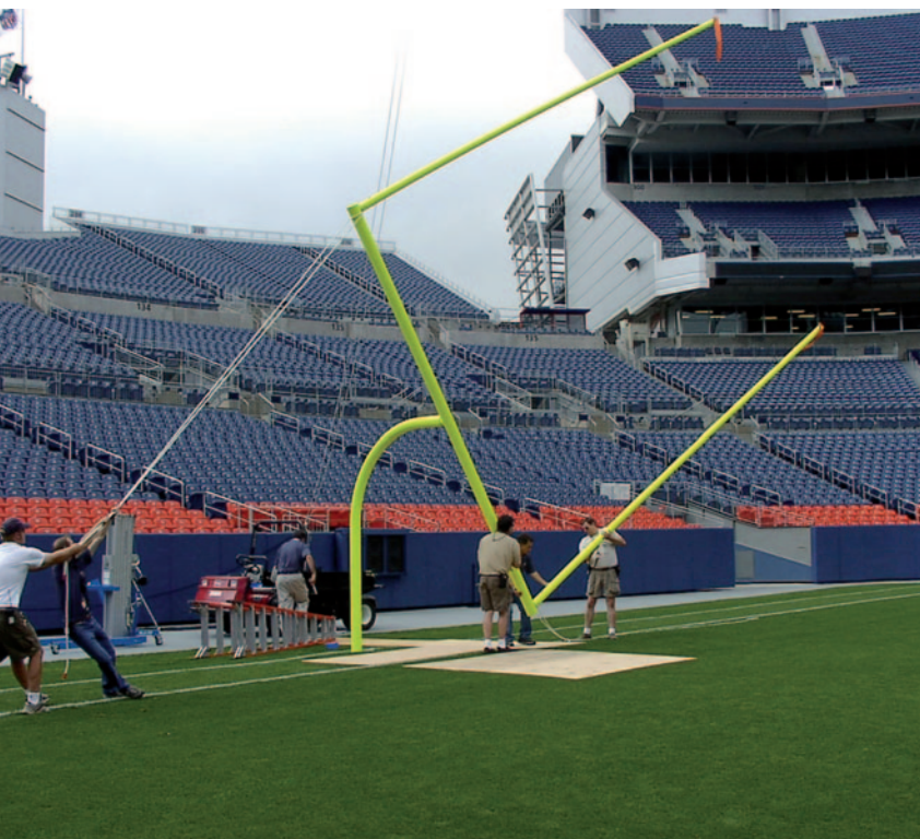
» PUTTING up a goalpost in Denver

You've got to keep up on technology and advancements in the industry. What passed for an "excellent" field in 1984 when I started would probably get me fired today.