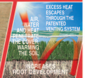
It works on the greenhouse principle, every time!