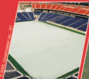
Covers for football and soccer fields are also readily available.