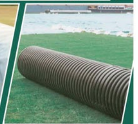
TARPMATE™ roller comes in 3 lengths with safety end caps.