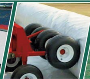
TARP MACHINE™ lets you roll the cover on and off in minutes.