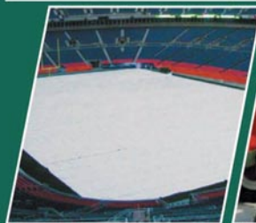
Covers for football and soccer fields are also readily available.